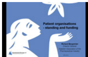
Patient organisations - standing and funding.