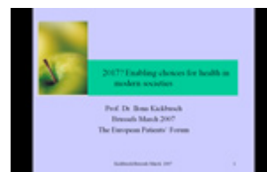
The prevailing environment in 2017. How well informed will patients be ten years from now and from what sources will information be available?