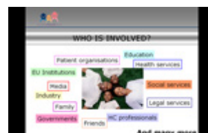
The Patients' Perspective